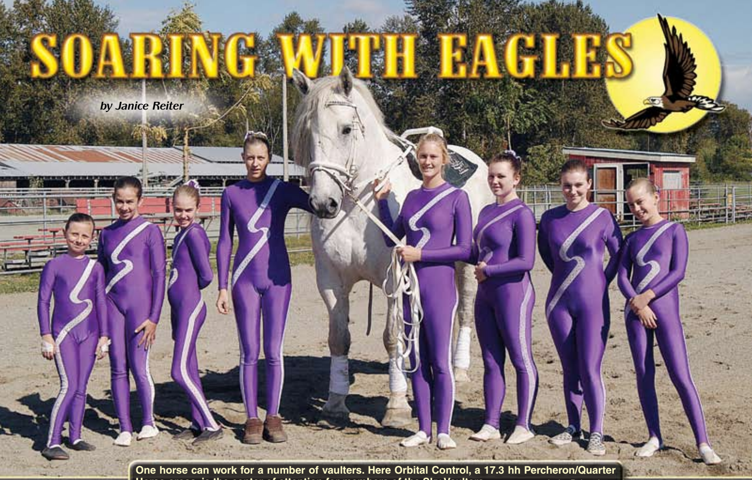
One horse can work for a number of vaulters. Here Orbital Control, a 17.3 hh Percheron/Quarter Horse-cross, is the center of attention for members of the Sky Vaulters.

If your idea of “getting air” is the childhood game of leap frog, then you had better fasten your seat belt.