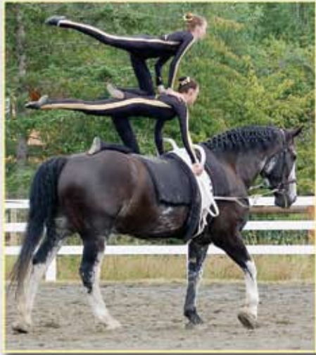
Demonstrations are an important way of introducing new people to the world of vaulting. It also shows that horses can come from other disciplines. Tiny previously was an eventer.